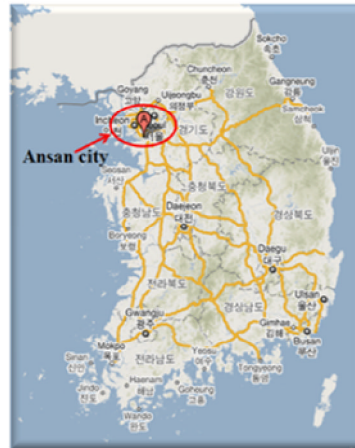
Figure 2 Possible location of recovery system plant